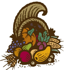
Thanksgiving Eve Service

This year's Thanksgiving Eve Service will be held on: